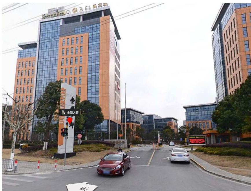
Photo of the Building

On your arrival, you can sign in on our reception in 6F; they will contact our trainer to guide you from this area to our training location. Please ensure that your travel arrangement accommodate arrival and departure so that you do not miss out on any training intervention time.