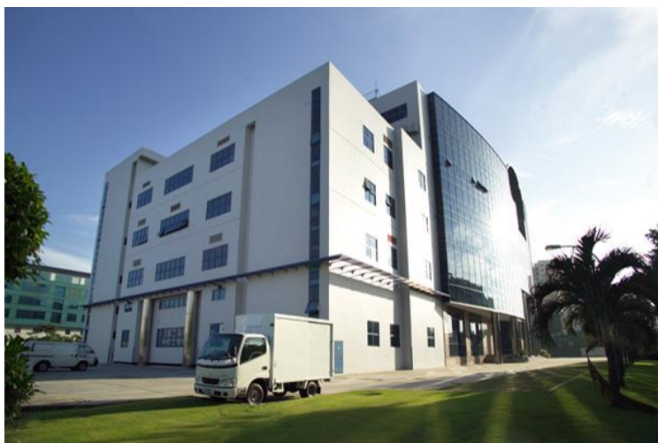
Photo of the Building

Please ensure that your travel arrangement accommodate arrival and departure so that you do not miss out on any training intervention time.